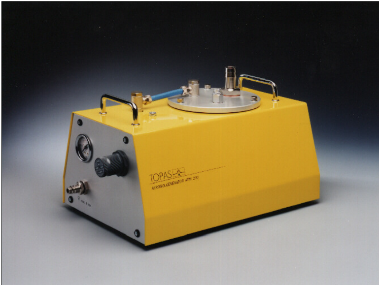
Atomizer Aerosol Generator ATM 230