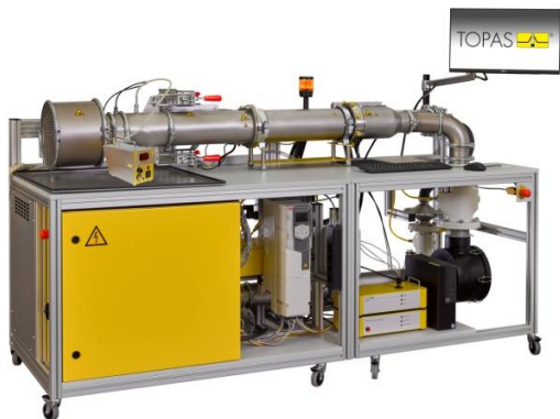
Aerosol Sensor Test system AFC 135.

The Aerosol Sensor Test System AFC 135 combines the features of the successfully established test systems for filter media and elements (AFC 131/ AFC 132). Additionally the range of application is extended to the development, testing and calibration of sensors for number or mass-related determination of the particle loading of aerosols (PMx- and PNx- sensors).