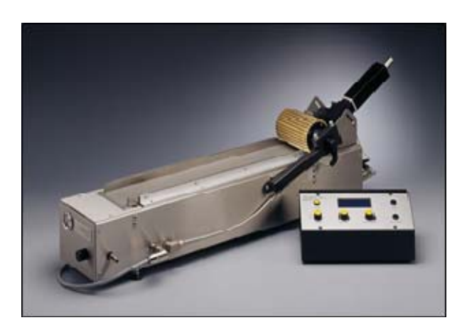
SAG 440 ASHRAE Dust Disperse

The SAG 440 ASHRAE dust disperser has been especially developed to meet the requirements as defined by the ASHRAE 52.2 and DIN EN 779 standards for testing the performance of particulate air filters. Due to the particular physical properties of ASHRAE test dust it was necessary to adapt the instrument to this material. The SAG 440 is particularly suited for dosing dusts containing a certain proportion of fibres and provides excellent results when producing test dust to check separation efficiencies.