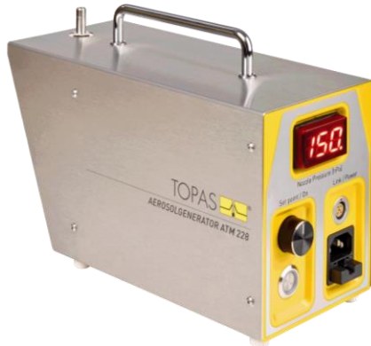
Aerosol generator ATM 228 with internal compressor and differential nozzle pressure control.

The aerosol generator ATM 228 is a further development of the aerosol generator ATM 226 and serves for the mobile generation of test and calibration aerosols from pure liquids, solutions and suspensions. The generator complies to all requirements of VDI 3491-2.