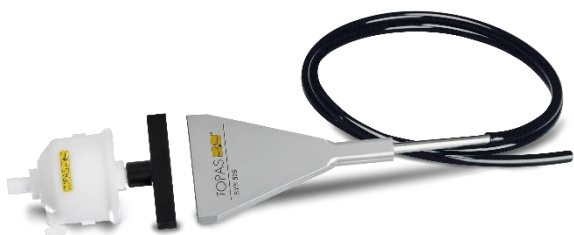
Isokinetic rectangular sampling probe SYS 529.

Isokinetic sampling probes are required, for example, for leakage testing of built-in filter systems in cleanrooms and cleanroom facilities. In the existing standards and guidelines, probes with rectangular cross-sections are recommended.